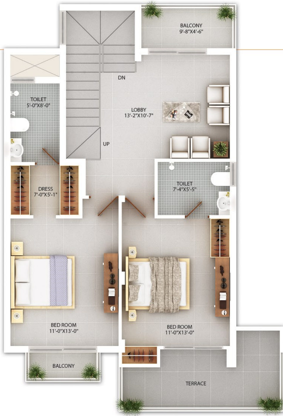
First Floor (East Face)