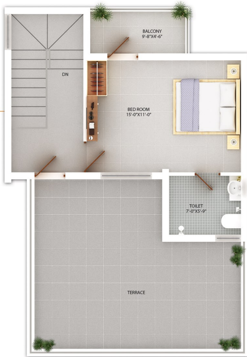
Terrace Floor (North Face)