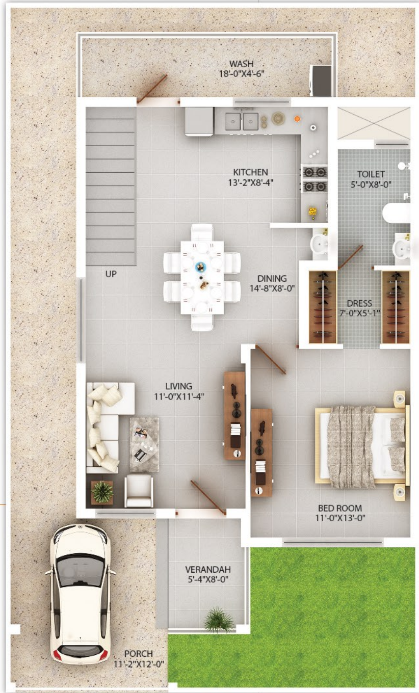
Ground Floor (West Face)