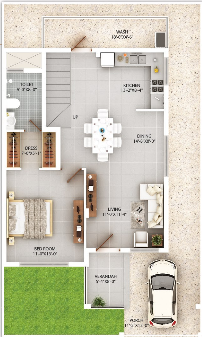
Ground Floor (East Face)