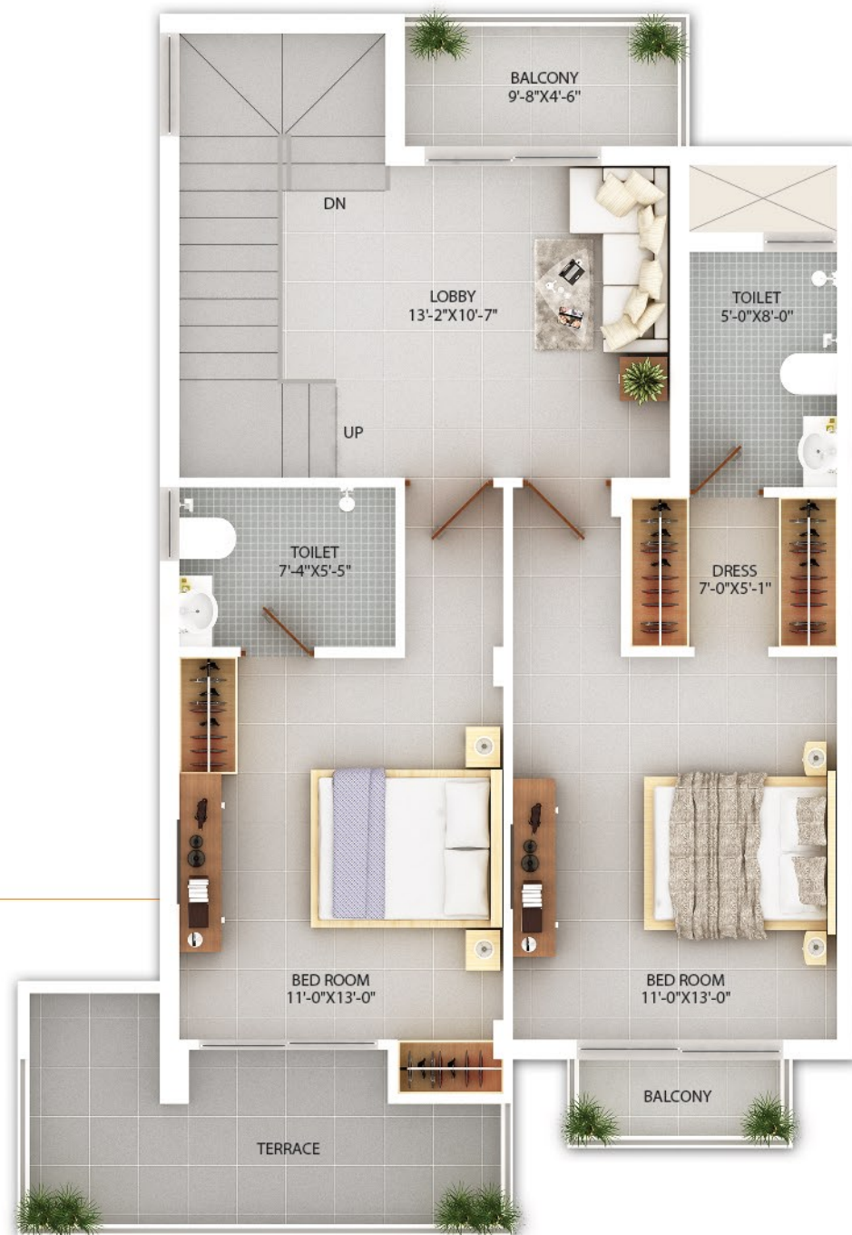
First Floor (West Face)