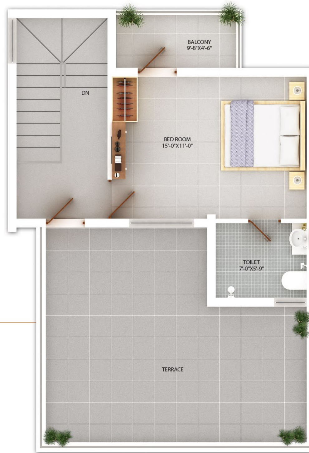
Terrace Floor (West Face)