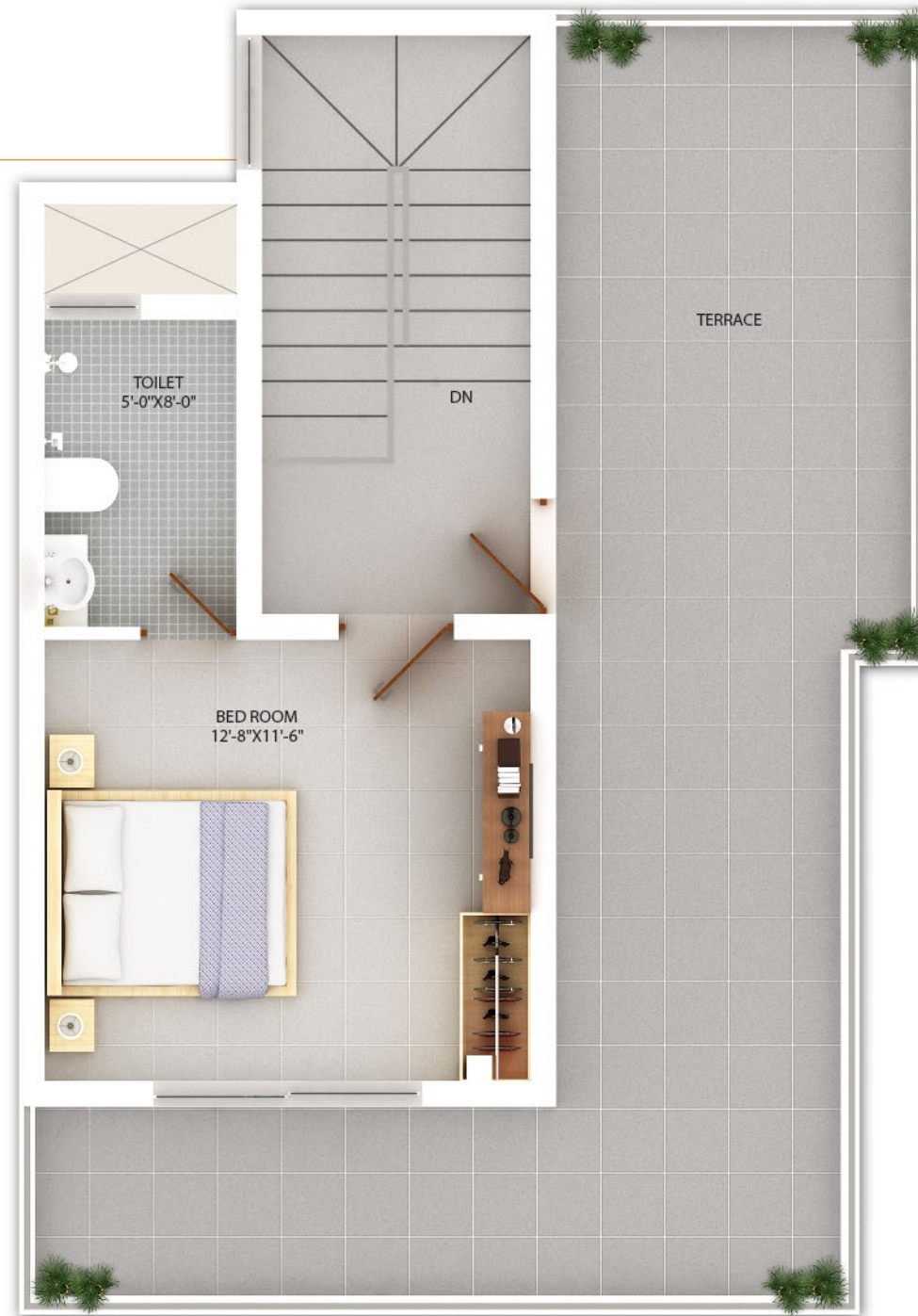
Terrace Floor (East Face)